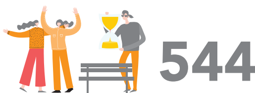
提供參與及服務社區的服務節數 No. of serving community programme sessions