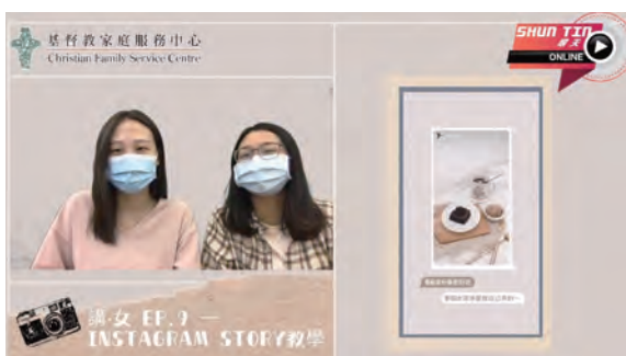
「順天Online」節目分享少女資訊。 We shared information with teenage girls through our webcast programme, "Shun Tin Online".

至2020年12月，單位更把節目質素進一步提升，建立了「講•青」IG專頁，以專題影片形式報導青年關注的文化、職涯等議題，讓社會更理解青年人想法，共錄得1,771瀏覽人次。另外，單位建立了心事投稿IG專頁「Post Eat」，目的讓有需要尋求傾訴的青少年，以不公開身份情況下，安心地向社工表達內心所想，同時藉以識別有需要人士，提供進一步情緒支援。