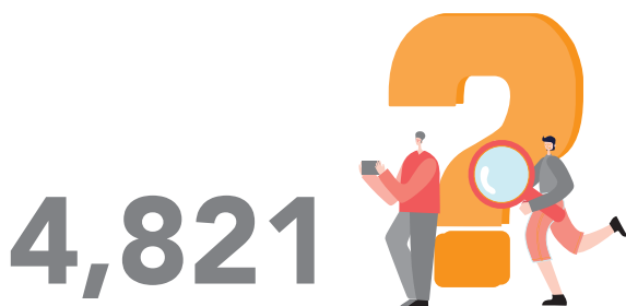
接受諮詢服務的人次 No. of attendance of consultation services