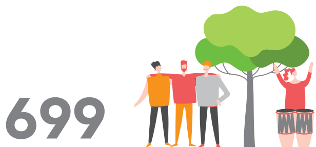
發展人際社交能力、體藝能力的活動節數 No. of developing social, sports and art skills programme sessions