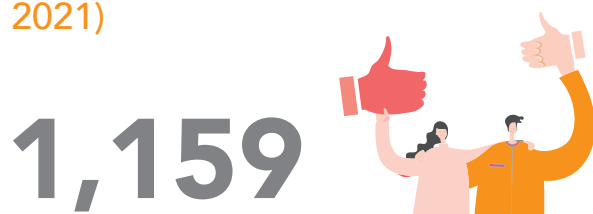
接受輔導的青少年個案數目 No. of youths counselled